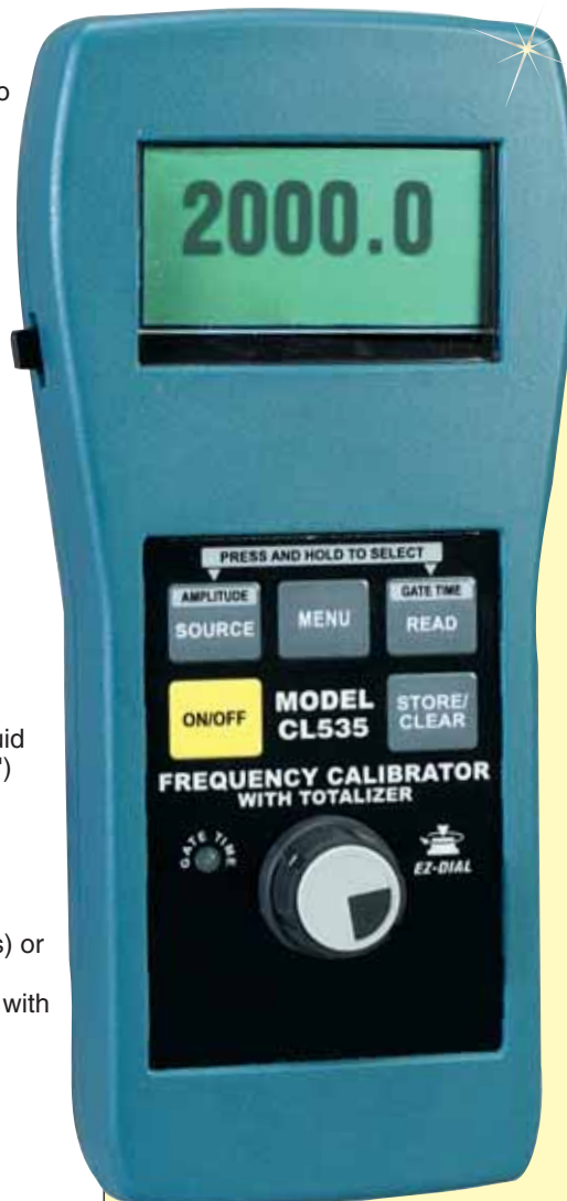
CL535, $995, shown smaller than actual size.